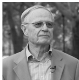
Admiral (Ret) Chris Barrie AC Chairman FearLess PTSD Australia & New Zealand

On behalf of the Conference Steering Committee, I welcome you to be part of this exciting opportunity to engage in these critical discussions and showcase and promote your business.