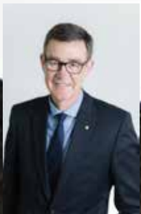
Sir Angus Houston